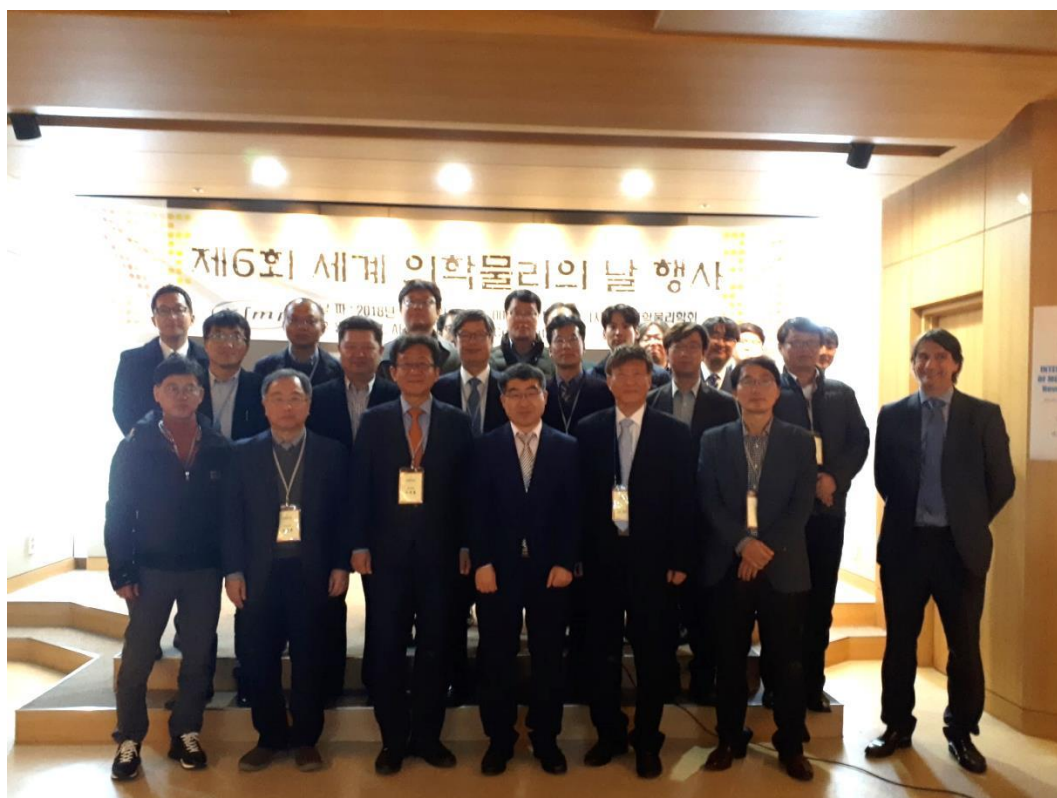
Group picture of IDMP in Korea