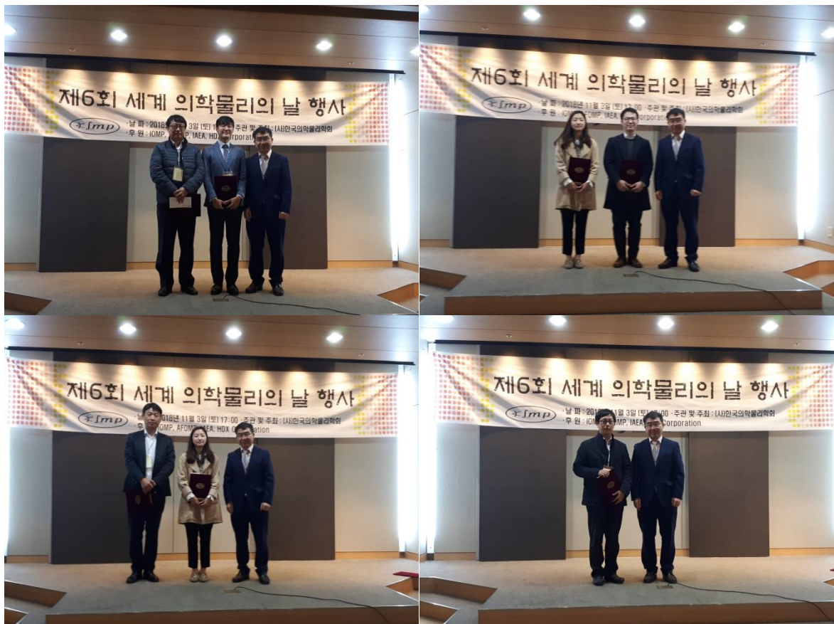
Original Research Awards