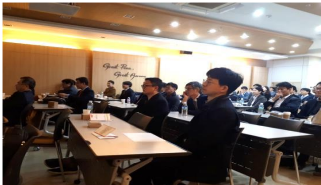
Pamphlet (left), placard (top-right) and attendee (bottom-right) of IDMP in Korea