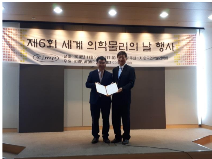
Excellent Review Award