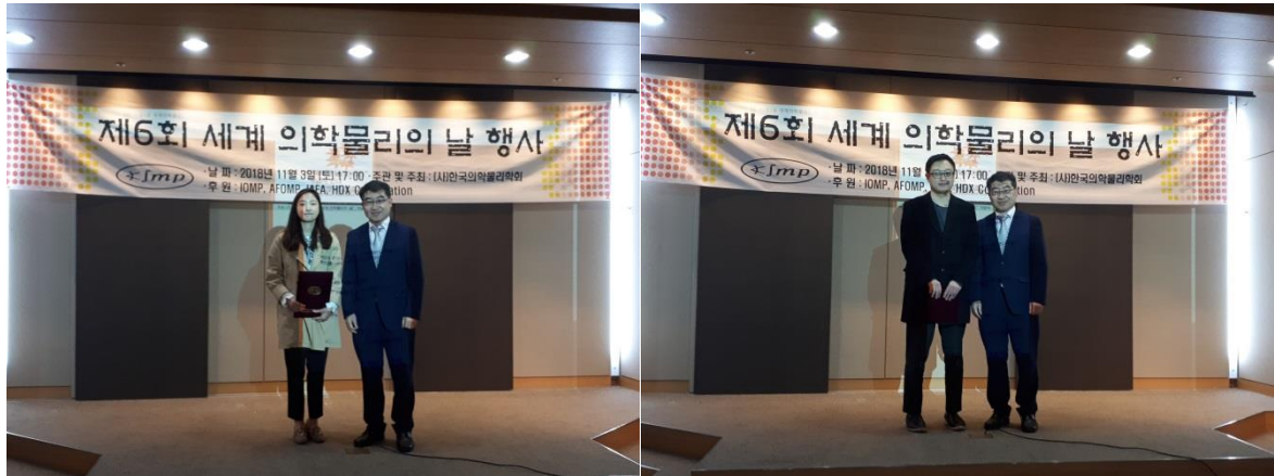
Young Investigator Awards