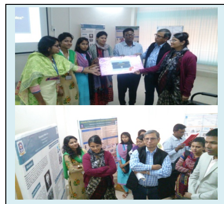
Fig.03: Poster competition: participants, judges and winners