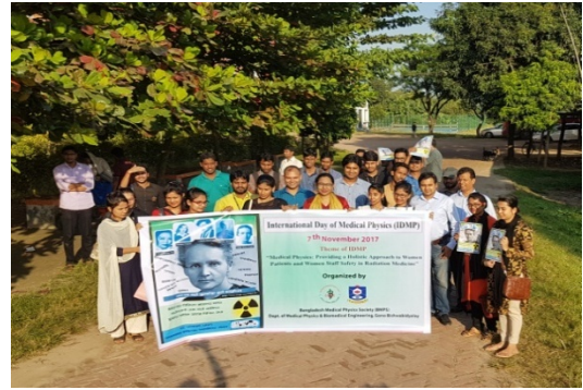
Fig 05: IDMP-2017 Rally