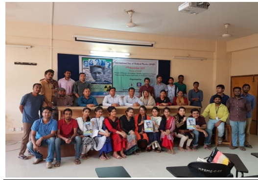
Fig.06: IDMP Seminar