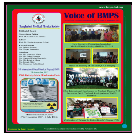
Fig. 02: Voice of BMPS

The aim of the scientific writing contest on "Importance of Medical Physicist in Cancer Treatment" (Fig 04) is to create public awareness and popularize the medical physics subject to all level of students with science background in Bangladesh. A good number of young students of medical physics and biomedical engineering submitted their paper. This program was arranged by paper submission according to scientific guideline, then the papers were evaluated in different criteria by the judges and finally 1 st and 2 nd winners were selected based on the evaluation report.