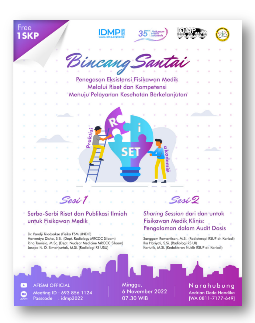
Figure 1. Invitation to join the IDMP 2022 event for members and the public. Joining members are given 1 CPD point.

In celebrating the 2022 International Day of Medical Physics, the Indonesian Association of Physicists in Medicine or Aliansi Fisikawan Medik Indonesia (IAPM/AFISMI) held a casual talk show themed "Confirming the Existence of Medical Physicists through Research and Competence Towards Sustainable Health Services" which was held on Sunday, 6 November 2022 (Invitation in Fig.1). The Talk Show started at 08.00 -11.00 with over 400 participants in attendance, both AFISMI members and the public. It was live streamed through YouTube and the recording can be accessed in the following link: https://www.youtube.com/watch?v=pNOT6h8vQCI.